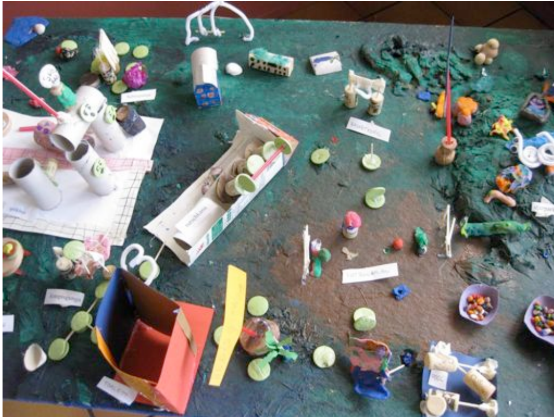
Figure 4. The urban games workshop was turned into a proposed design layout for the park.

material for their board game. When the teacher told the kids the sad news from the housing company, she also said: 'but we will do the park anyway, won't we?' This was approved. So they built the model during that day, formed as a board game, a fantastic creation and to a great extent also feasible (see figure 4).