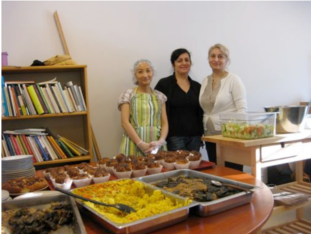
Figure 7. The pilot project carried out a workshop lead by a South African architect where ten women involved in a catering course as a labour market arrangement took part.