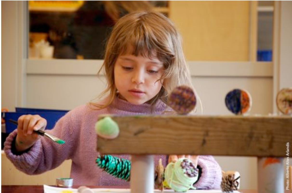
Figure 2. Children from Emma school were involved in the process.

This part of the work we carried out together with our colleagues in another pilot project presented in this book, Urban Games, which was a group knowledgeable in didactic tools for communication. They wanted to test some of their tools, and we wanted to learn how the kind of tools they developed could be used as part of urban empowerment processes including citizens. We learnt several things from these workshops. One lesson was about the choice of tool for different age groups, where we easily could conclude that construction of board games was a great tool for communication on urban planning with children in the ages of 6-9, very well adapted to their impulsive creative capacity (see figure 3). At the ages of 10-12, on the other hand, electronic games would have been preferred, as these children seemed much more cautious to freely express their creativity and therefore needed something that would really catch their attention – e.g. computer-like games. Another lesson was about outcome, as it in our pilot project on urban empowerment was considered that the games were tools not only for creativity in itself, but also to be part of an urban planning process. Here, again, the smaller children stood out as very creative in a special way, which we believe had to do with two things that will be discussed below.