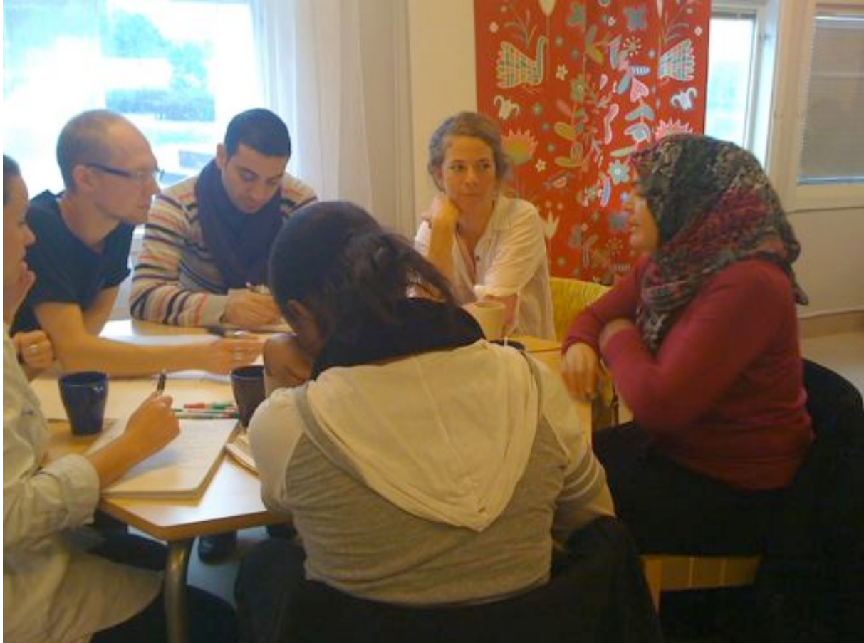
Figure 8. The students acted as assistants in codesigning; the teacher and social work students in each group took the role of translators and the architect students of shapers – of the ideas of the ten women.

aspects. The Meetingplace people – by taking a step back – contributed in a most sensitive way to this shift in focus for the workshop. The final result of the workshop was five built models of how the actual building at the square could be refurbished in order to fit for a café and a meetingplace (see figure 10).