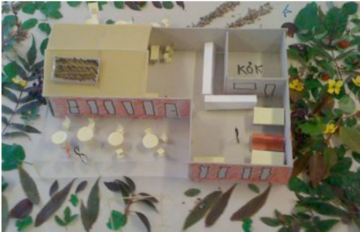
Figure 10. The final result of the workshop was five built models of how the actual building at the square could be refurbished in order to fit for a café and a meetingplace

experience, this is partly related to organizational learning (Argyris and Schön 1995), thus to how organizations learn from the employees, and vice versa. The social worker in charge is not part of an organization that has learnt. It has, as an organization, not found a way forward that falls within the boundaries of the competition law. The social worker, however, had quite a lot of 'negative capability' and found another way forward: the women will now start a cooperative café in the premises of a learning centre in the city centre instead. This solution is of course very satisfactory for the women, but unfortunately the suburban residents and employees lose the chance to eat the wonderful food they produce.