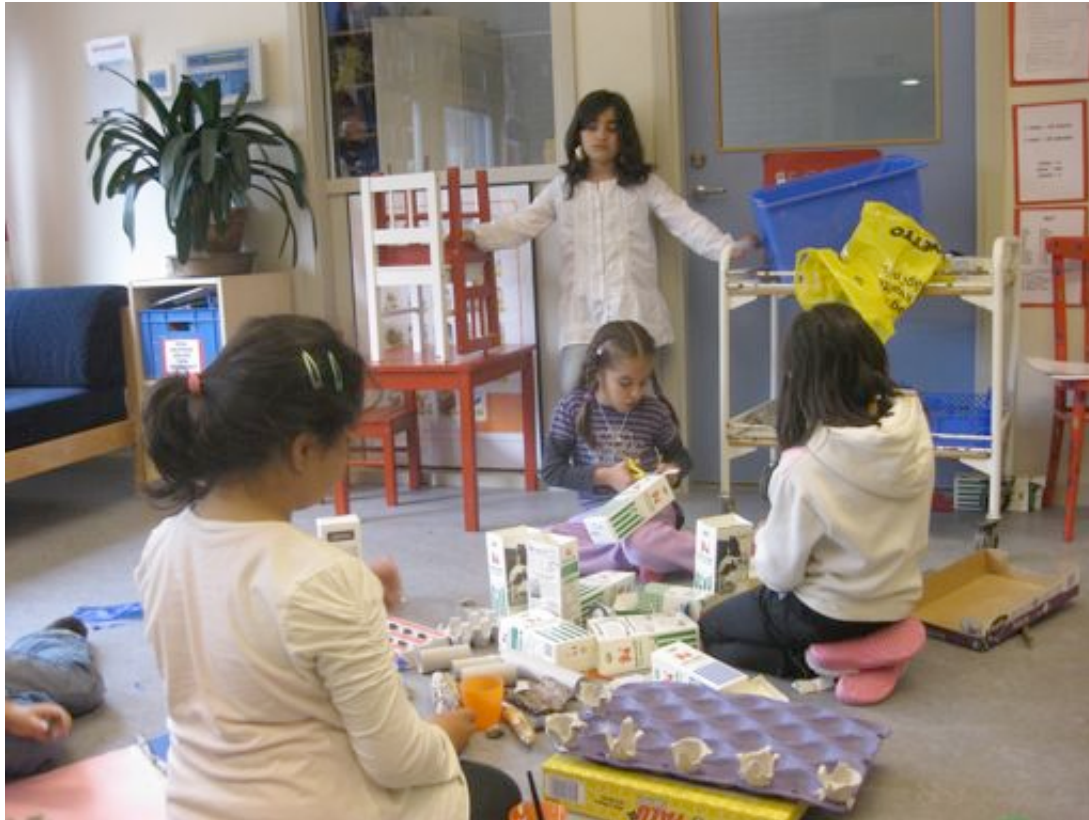
Figure 3. Construction of board games was an attractive way of working for children in the ages of 10-12.

One reason was mentioned above: if the tool had been electronic for the elderly it would perhaps have captured their attention better and freed their creativity more. Now they did not really succeed in using the game as a tool for urban planning. The other reason has to do with external causes in combination with the skills of the teachers – thus their personal capability of transforming problems into triggers for learning. The external cause was a phone call from the public housing company the day before the workshops were going to start: they told that the event park in Hammarkullen was not going to be built, because they were just told that a new European Union adapted law, three months old, forbid all Swedish public housing company to make investments that are not businesslike. Thus, they could only motivate refurbishing the park, if it really would show that it could increase the rents. And rising rents in housing areas like Hammarkullen, where many of the poor people in Sweden live, was not in question at all. Moreover, the current land was actually not even owned by the housing company, but by the park and nature administration of the city.