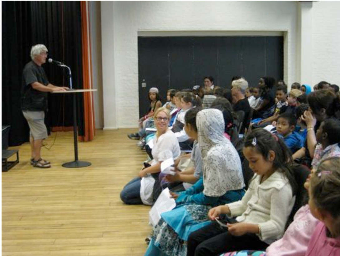
Figure 6. The children raised many questions to the employees from the housing company, they really wanted to understand the reasons for stopping the project.

Here we take a break from the case description and turn to the 1 st of the four questions we are going to answer in the pilot project: What are the characteristics of the 'cultures of participation and learning' in which inhabitants participate? This question may perhaps be understood as describing cultures of participation and learning as something normatively 'good' but our interest has not really been to position ourselves in that way. As is hopefully obvious above, participation and learning can be considered both as positive and negative at the same time, depending on what perspective you have. However, we still of course want to search for the answer of that question. When discussing our analysis of all our different activities, we came with this answer of that question: