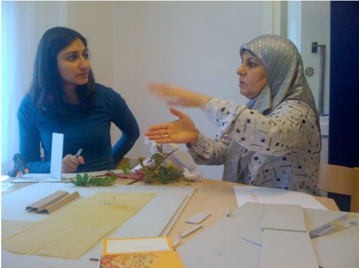
Figure 9. Architects and inhabitants obviously do not always speak the same language when trying to communicate on the physical environment.

Many of the Café women are still involved in the Meetingplace but their café idea did not go as expected. When inhabitants become co-actors in urban governance and development, they also become producers rather than mere consumers of the urban fabric. Empowerment thus releases and redirects energy, and to a certain extent it can also be considered a source of new energy. What the actions of the social worker that supported the women gave to the them, was time to learn some skills they lacked. Thus, he made it possible for them, while on welfare, to get training in catering, business economy and health issues. Additionally, this training was organized so as to empower them as a team, which was why he had decided to take part in the workshop with the design students in the first place. In this way, he also enabled the social work and teaching students to be part of the learning process – which was very much in line with the learning objectives for their courses.