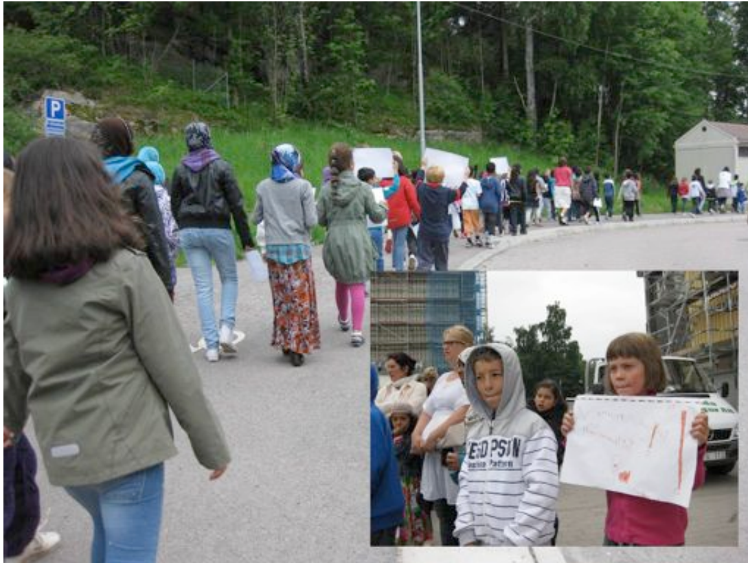
Figure 5. The children marched all the way from the school to the Peoples hall where the model of Hammarpark was handed over to the housing company.

This is not a sunshine story. We would never belittle the deep disappointment most pupils and teachers felt when the negative news about Hammarpark showed up the same day the workshop started. Of course, it would have been much better if the reconstruction of the park within a couple of months would have been out on procurement and built before next summer, which was the plan. Instead of being there unattended, like a barrier between the square and the homes. However, the pilot project need to learn from negative experiences as well, and they have actually often been more telling than our positive experiences. We have after this experiences been occupied with the question of how the involved teachers – as part of their ordinary professional work – could turn their disappointment into a learning experience. What was it they had, as individuals and as an organisation, that gave them the capability of handling uncertain and rapidly changing processes such as this?